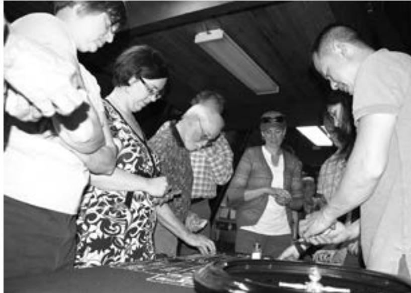
SYC Members enjoying the May 26th Opening Dinner and Casino Night.

JUNE 27, PHYSICIANS' DINNER If you are a keelboat owner, consider volunteering to take the med school residents out on the lake for an evening sail. You will be rewarded with a complimentary dinner, and should you paradoxically seek advice on how to lose weight, your guests will doubtless be happy to give it to you.