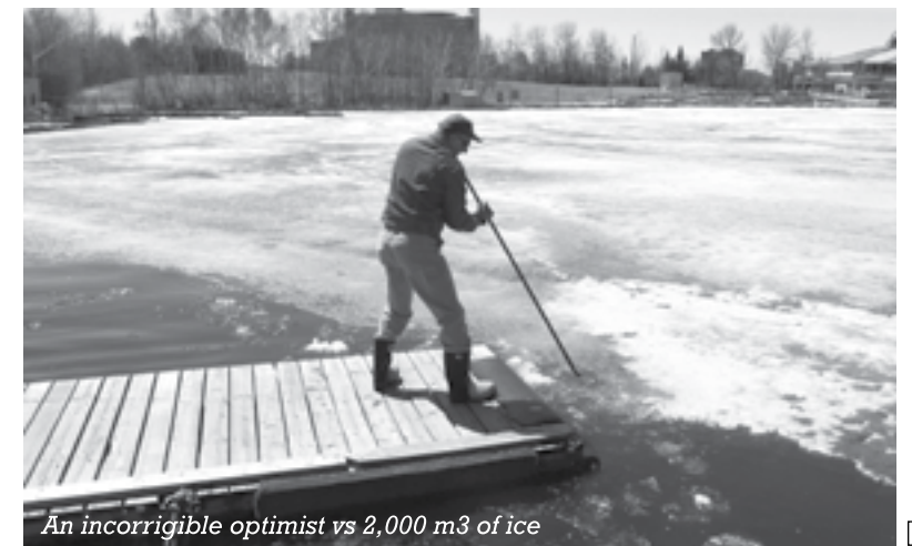
An incorrigible optimist vs 2,000 m3 of ice